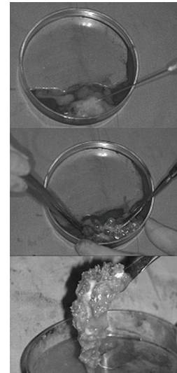
FIGURE 1: Preparation of autologous bone-platelet gel. Autologous bone particles mixed with PRP followed by activation. This gel-consistency scaffold can be easily handled [64]. Reprinted with permission from Elsevier.

3.3. Platelet Gels Blended with Autologous and/or Allogeneic Bone. Considering that autografts are the standard procedure for clinical bone grafting, it is intuitive to examine the potential of autologous bone in combination with platelet gels (Figure 1). Few in vivo studies have been conducted to explore this combination. Such study confirmed that autologous cancellous bone combined with an autologous platelet gel (compared to autograft alone) enhanced bone regeneration in an in vivo critical-size cylindrical defect (11 × 25 mm, diameter × depth) on load-bearing long bones of minipigs [63]. Clinically, the majority of autologous platelet gel and bone graft experiments focus on oral and maxillofacial bone